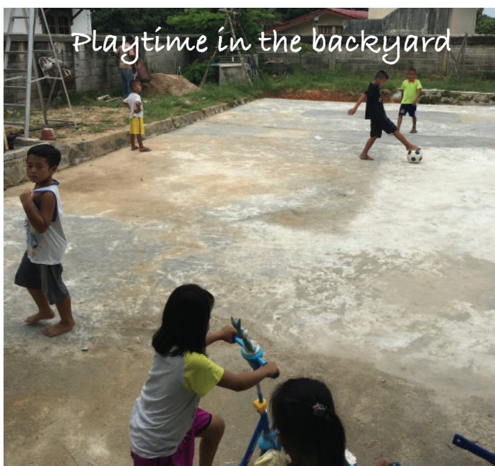
Playtime in the backyard