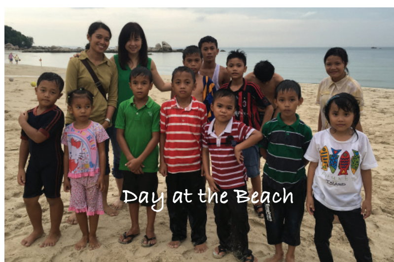
Day at the Beach